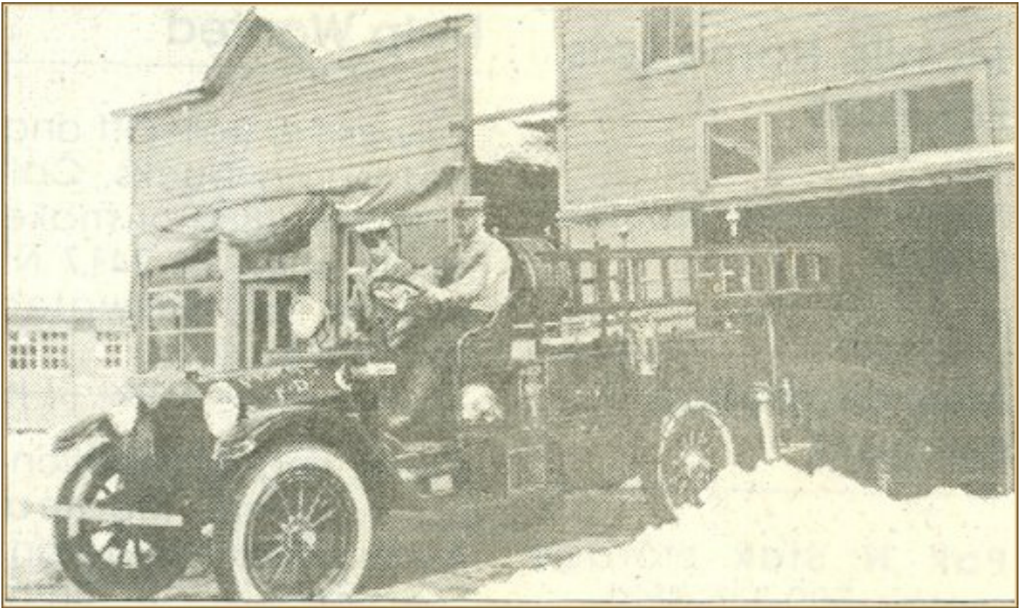
Available information puts these two wooden front buildings at the southeast corner of 7th and Delaware. The buildings face the west. In the left background, the building in photo A is visible. Names of the two firemen on the fire truck in this photo are not known.